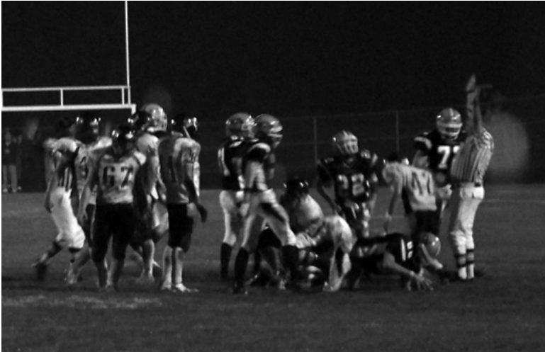
Buccos celebrate after the referee confirms that their fierce fight for the fumble was a success.